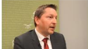
Interview: Radim Sršali - Mayor of Dolní Studénka, Czech Rep... @scotruralnetwork · 3 plays

The Scottish Rural Network supports and promotes rural development through the sharing of information, ideas and good practice. Read more