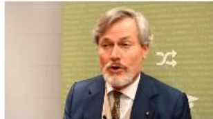
Interview: Gunter Paul, author of 'The Blue Economy' @scotruralnetwork · 4 plays