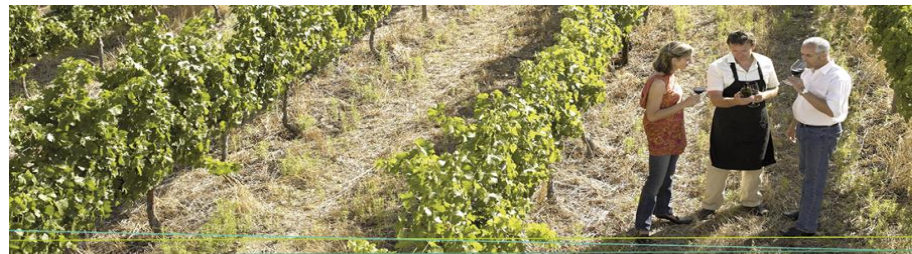
EIP-AGRI WORKSHOP OPERATIONAL GROUPS: FIRST EXPERIENCES 20-21 APRIL 2016 - LEGNARO, ITALY

Participants: mainly MA and partners in OGs