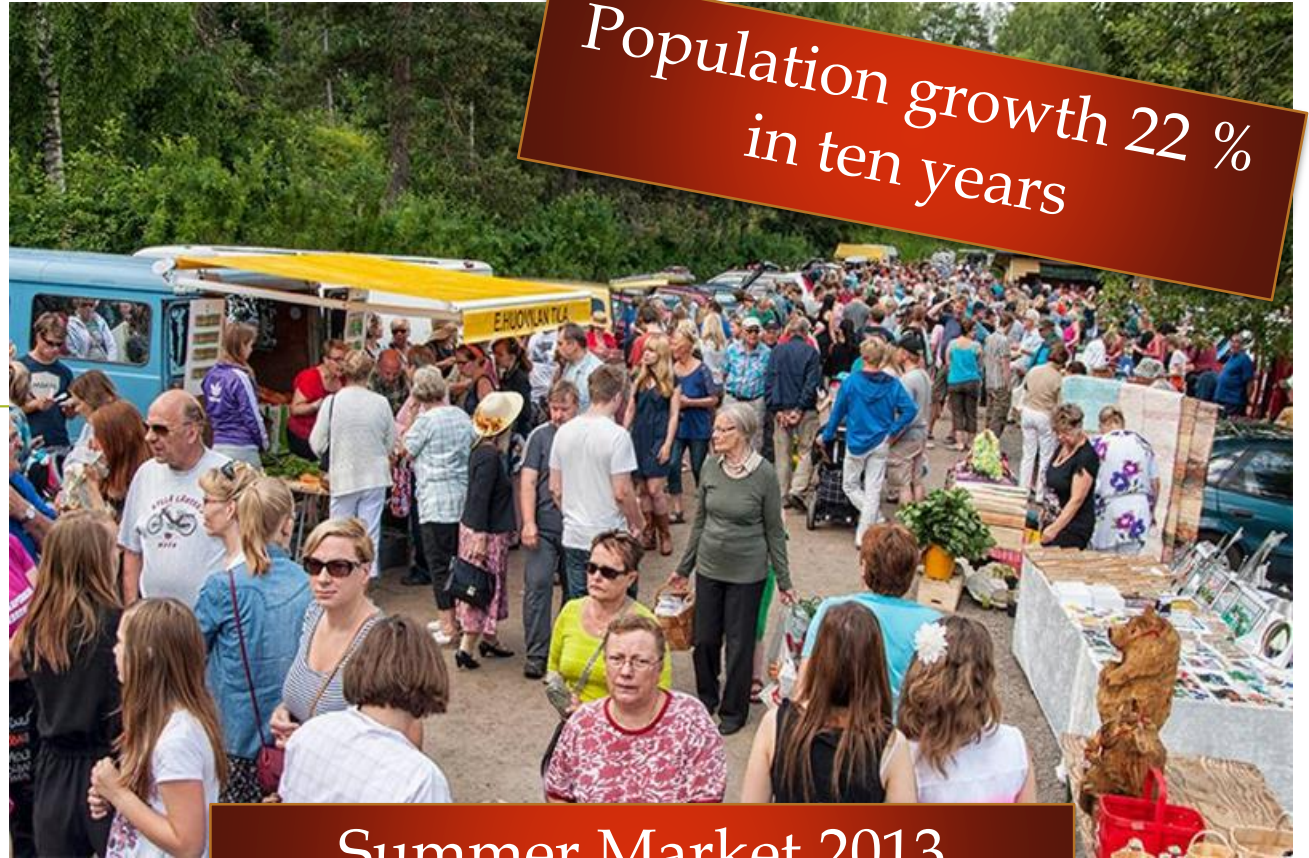
Summer Market 2013