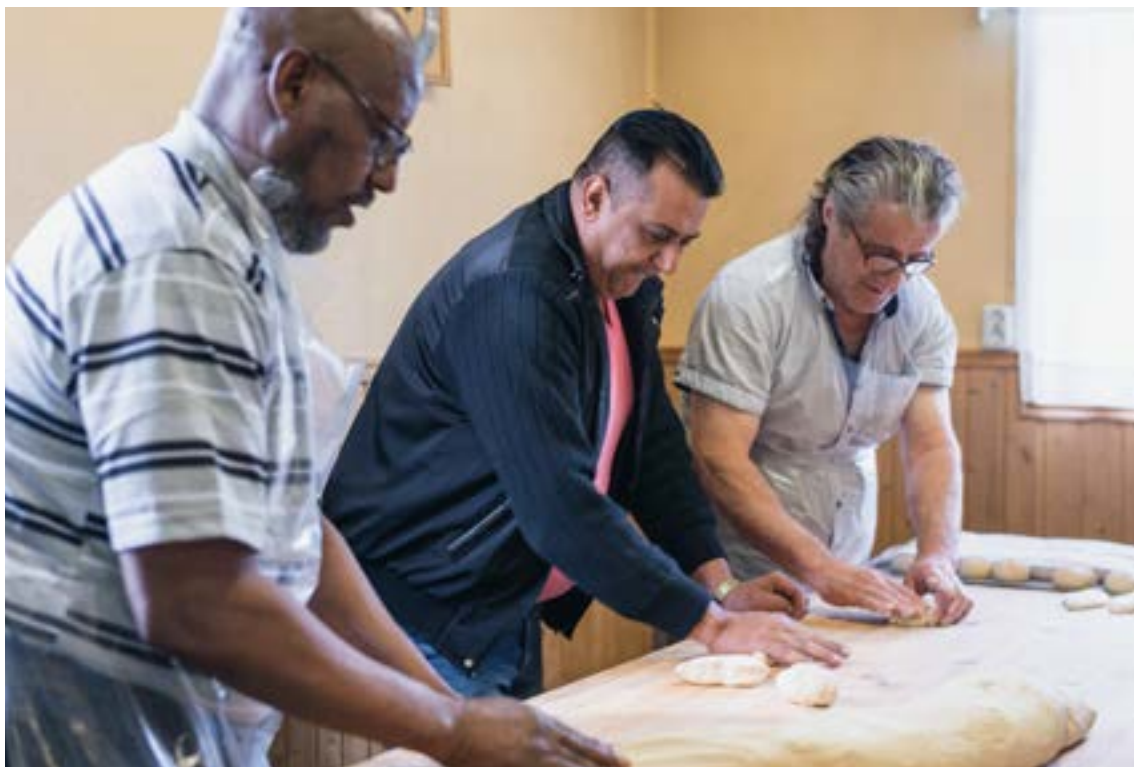
Baking bread is hard work, but also allows time to start conversations and get to know one another.