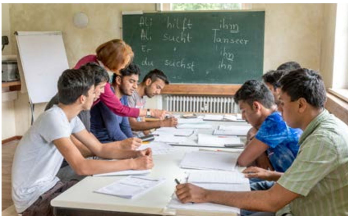
Many language courses are delivered across the territory to help immigrants to learn German.

With guidance and consultancy support from the LAG, the project brought together existing boards, advisory committees and representatives of the