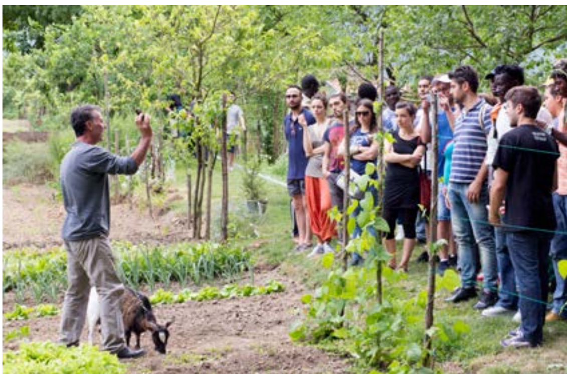
Young Italians and immigrants followed a course of agricultural training together.

The project developed a working relationship with a nearby refugee centre, 'Atina-Sora'. One of the