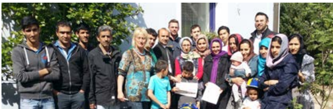
Easier access to information and training is supporting improved integration of refugees and migrants.