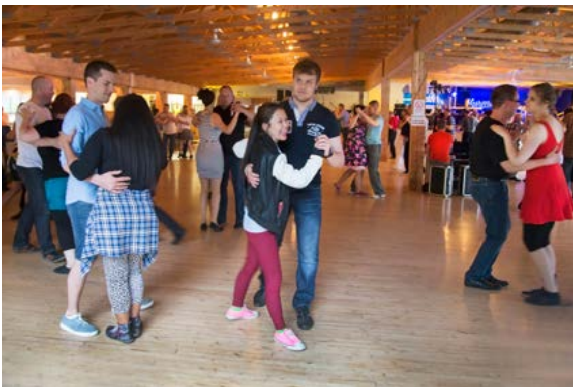
Social events are used to bring communities and individuals together.