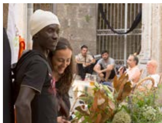
Several immigrants have become engaged in the Rise Hub association that has resulted from the project.