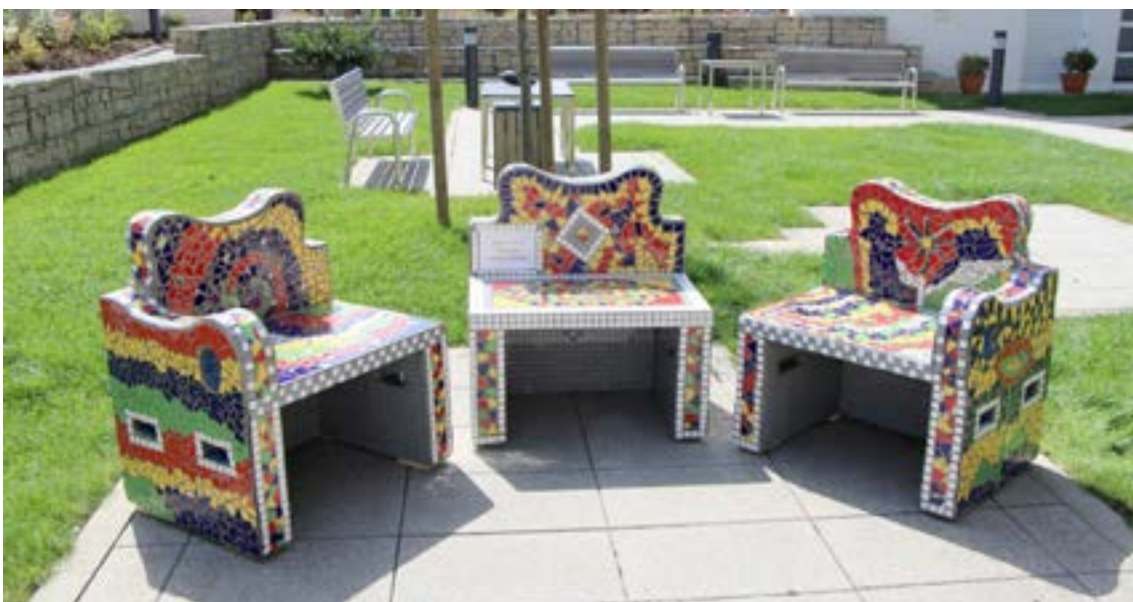
The 'integration couches' act as intercultural meeting places and symbols of social integration.

The project's coordination service worked closely with schools, youth centres, cultural institutions and sports clubs to raise awareness of diversity and develop community activities.