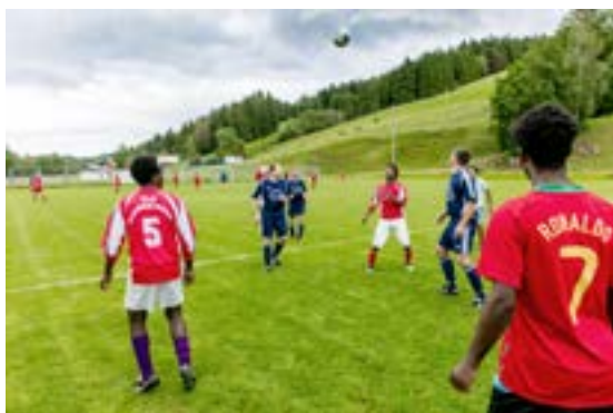
Immigrants and locals come together through activities such as football.

“If a community is able to recognise, appreciate and use the benefits of diversity, society will become more knowledgeable and competent. Safety and quality of life will increase because inclusive cultures can deal better with threats.”