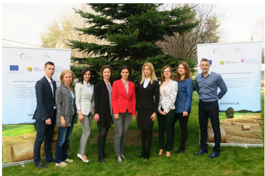
Central Unit Team