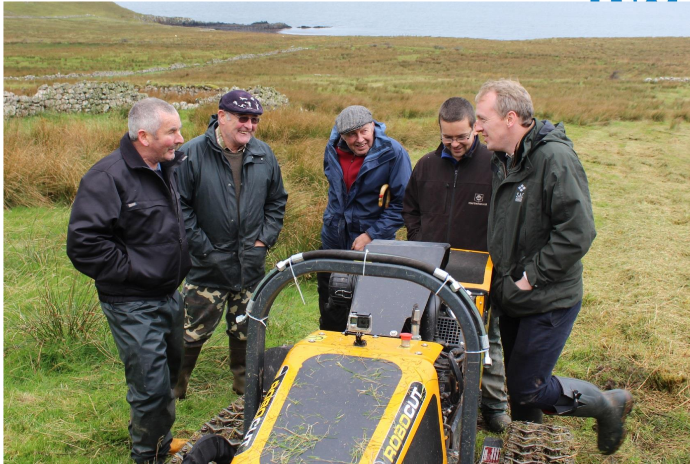
Demonstrating new technology – a robot rush cutter