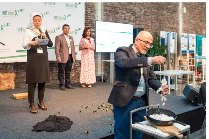
Incorporation Commission 2016