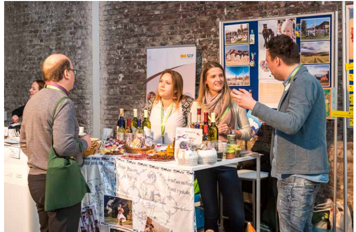
) European Commission,