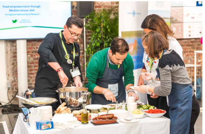
European Commission, 3