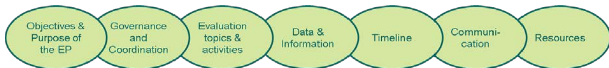
Figure 1. The minimum requirements for the evaluation plan

The seven sections of the evaluation plan are described further in the following chapters. For each section, a paragraph of the minimum requirements is shown in a green box. Key terms are discussed for each section with a view to achieve a common understanding of the main issues and concepts. A number of guiding questions outline what should be considered when drafting the respective section of the evaluation plan. Practical tips show the most important dos and don'ts. Finally, selected cross-references indicate to the interested reader where further information can be found in Part II and III.