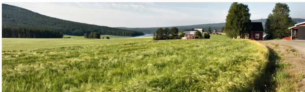
Landsbygdsnätverkets arbetsgrupp för planeringsfrågor vill att kommunerna tar in även landsbygden i sina översiktsplaner.