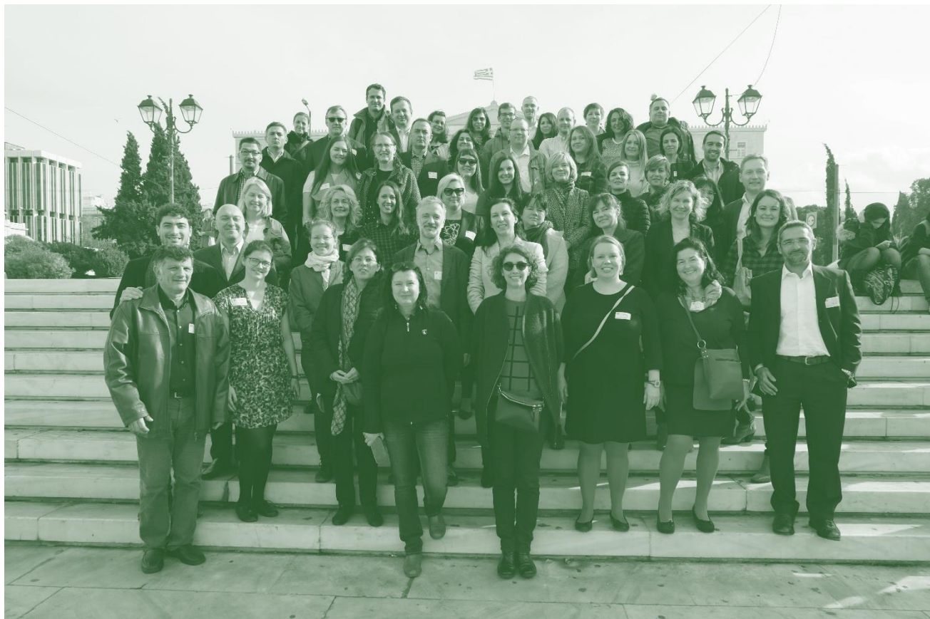
Workshop #6 (30 Nov./1 December 2017 in Athens): Evaluation and National Rural Networks: How can NRNs support evaluation?