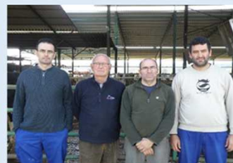
Granja Hermanos Reverte