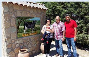
Granja Fuentes del Tajo