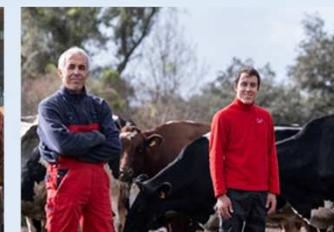
Granja Cabo Gomez