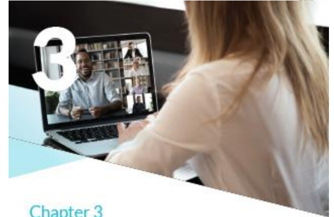
Chapter 3 Optimising Digital Connectivity