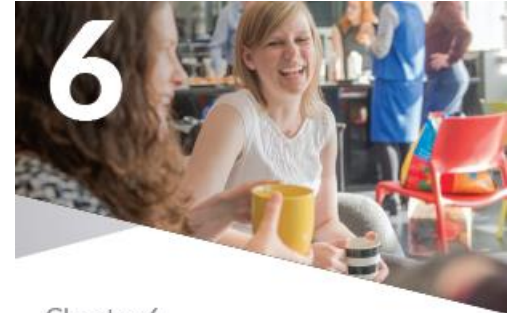
Chapter 6 Enhancing Participation, Leadership and Resilience in Rural Communities