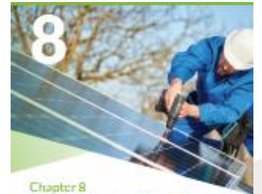
Chapter 8 Transitioning to a Climate Neutral Society