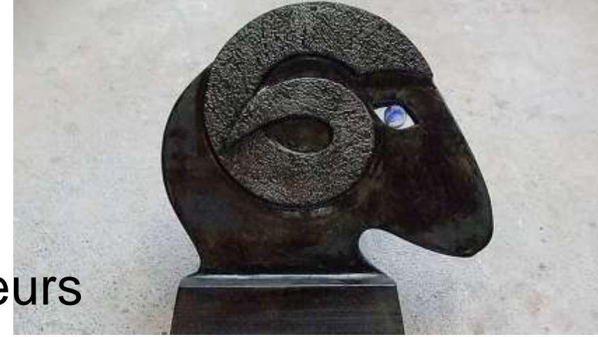
Ullbagge "The Wool-ram"