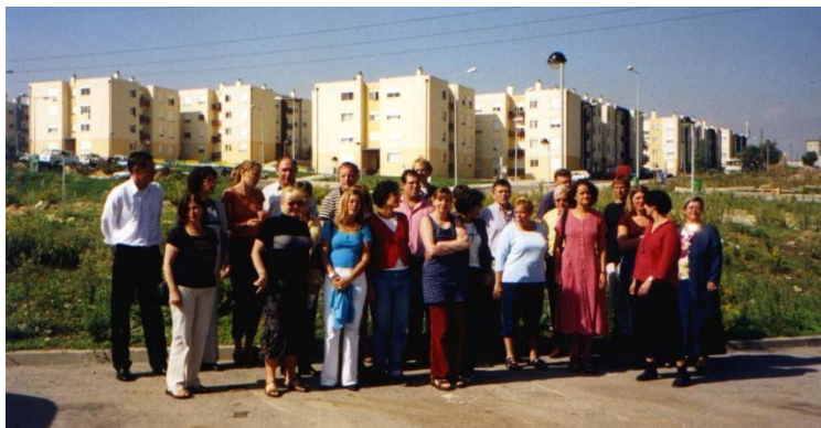
The team getting ready to present the policy recommendations

At national level, politicians have already started listening. The concept of training asylum seekers to become international health advisors may not have had such a positive impact in