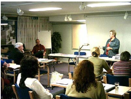
Talking, consulting and exchanging are essential components of a successful transnational partnership

How well can asylum seekers really integrate in the different Member States? Under the EQUAL transnational activities, eight Development Partnerships (DPs) from six different countries representing a range of organisations working with asylum seekers, came together to look at this question more closely. ASPIRE!, established for this purpose was the largest transnational partnership working with asylum seekers in EQUAL.