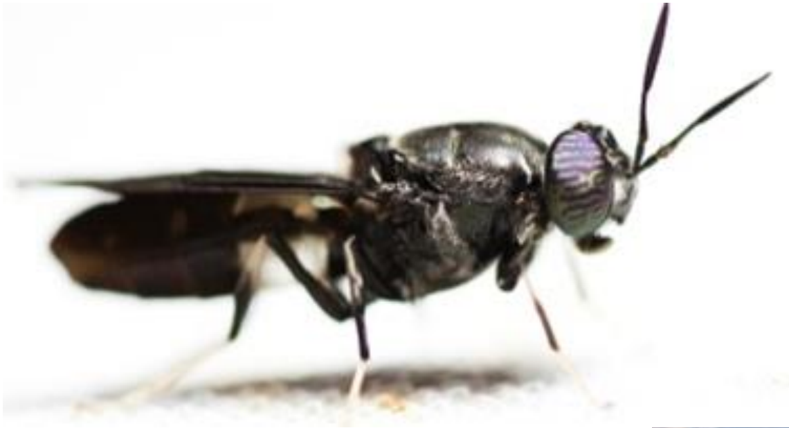
Hermetia illucens Black Soldier Fly