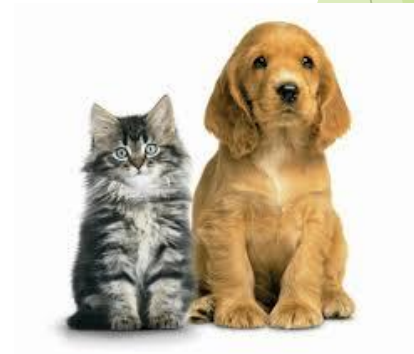
Cats & Dogs