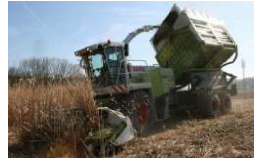
CHAMBRE D'AGRICULTURE PICARDIE

In 2008, 20 national organizations working in biomass field created the RMT