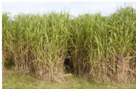
Strips of willow and miscanthus