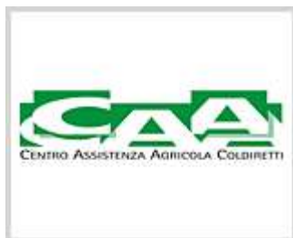
Technical assistance Centre