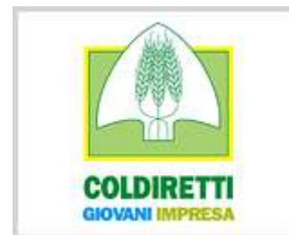
Coldiretti representative body for Young farmers