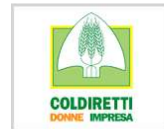
Coldiretti representative body for Women farmers