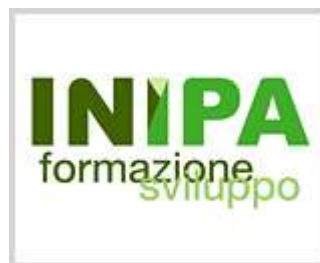
Coldiretti Training Body