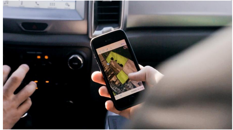
Figure 2. Easy to use GPS based applications, and equipment help farmers better monitor farm operations and to optimize input material usage

Guidance systems, Auto steering, GPS navigation, and Real-time kinematic (RTK) positioning, In-cab displays are the technologies making precision machinery work easier (Figure 2.). The price of the technology mostly increases while the accuracy of the equipment is improving from meter to centimeter range.