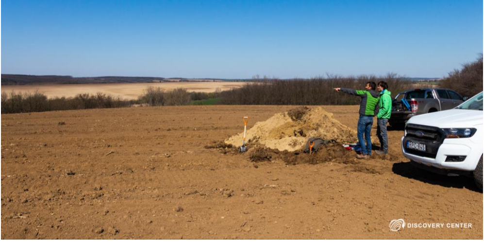
Figure 4. Researchers studying a degraded farming landscape. Proper, in-depth data collection and understanding of the farming environment is the key to optimized and sustainable farm management.

Most of the precision farming technologies are evaluated against their potential to increase income for farmers and to minimize the load on the environment, thus enhance sustainability and decrease soil pollution from agriculture. With the assistance of PA technologies, selected input materials (pesticides, fertilizers, and other chemicals) are only applied when and where there is a need. Some technologies enable applications with machine and hardware-based solutions (such as section control to avoid multiple applications on the same spot), while some are supported by machine learning and artificial intelligence. But they share the same goal to optimize profitability and further to increase sustainability with better management of natural resources (Figure 4.).