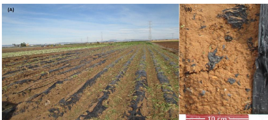
Figure 2. Mulch decomposition in an agricultural field (A), contributing to the contamination of soils with plastic debris (B).

The most common plastic used for mulching is Low Density Polyethylene (LDPE) which is highly resistant. LDPE mulch must be removed after harvest and uncompleted removal leads to plastic accumulation in soil (Figure 2).