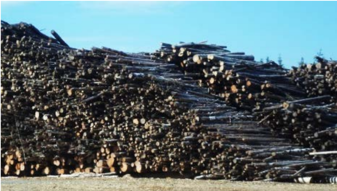
Piles of biomass stored for energy production (Finland)