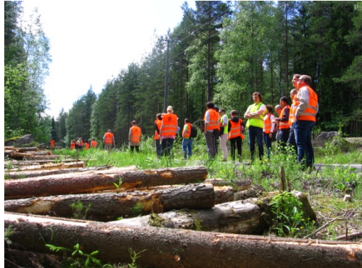
Experts working during the first and the second meeting of the Focus Group