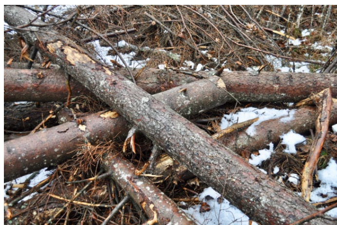
Forests affected by a heavy ice-break episode followed by a bark beetle attack in Hotedršica (Slovenia)

One of the strongest arguments for the use of wood is its function as carbon sink when used as solid material for long-term uses, e.g. wood products for daily life, but specifically wood in construction and other mid-to-long term applications. The substitution effect is evident. Climate strategies involving forest biomass can achieve better performance by enhancing