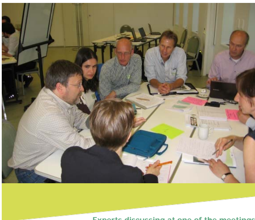
Experts discussing at one of the meetings

However the Focus Group on SMFB took into account the overall sustainability forest biomass mobilisation and the analysis of economically promising new ways of mobilising biomass should always take into account their environment-climate and social sustainability.