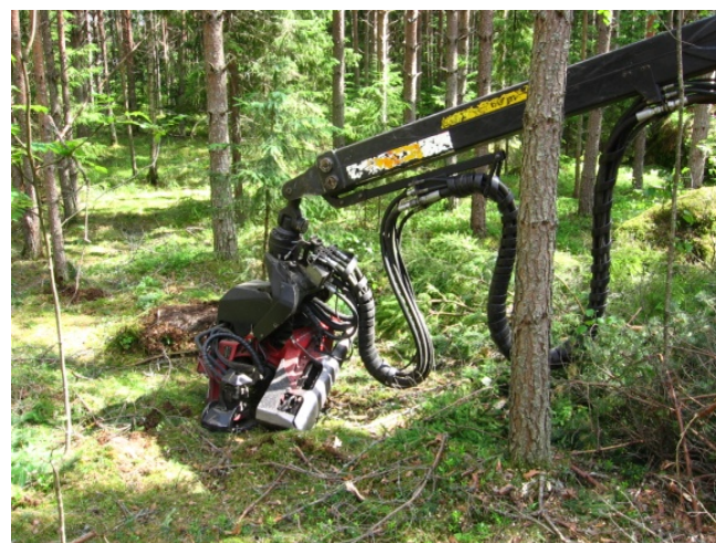
Mechanized harvesting of Spruce