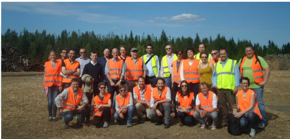
Group picture of the experts during the first meeting in Tampere (Finland)