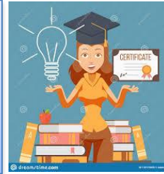
Education & research

2014: 20 founding members 2020: 110+ members; multi-actor and multi-sectorial approach