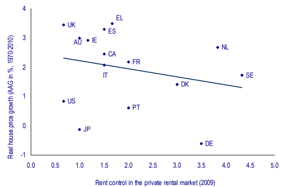
Graph II.4.3: Rent control and real house price growth (1)

(1) Rent control is measured with an OECD composite indicator combining data on the extent of rent controls, on how increases in rents are determined and on the permitted cost pass-through onto rents.