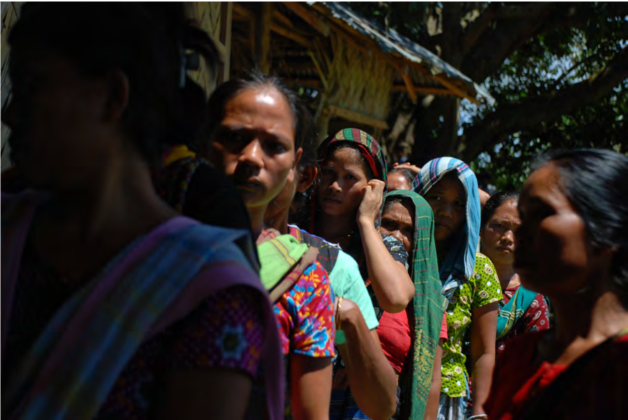
Women line up to receive food assistance.

the action may actually contribute to maintaining or even reinforcing existing gender-based stereotypes, discrimination and inequalities. Evidence shows that gender-sensitive livelihood opportunities in humanitarian assistance remain limited. For example, cash for work projects can at times neglect opportunities for women or only propose very stereotyped activities that can contribute to locking women into their traditional roles. Another example is the case of lesbian, gay, bisexual, transgender and intersex persons, who may be particular targets for perpetrators of gender-based violence. In this case, there should be careful consideration before addressing protective measures exclusively at this group, since these could make them more easily identifiable and even expose them to further violence.