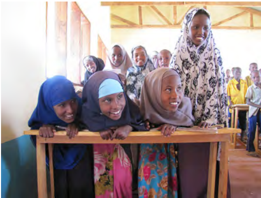
Some children living in the world's largest refugee camp Dadaab have access to education thanks to the collaboration between European humanitarian and development actors.