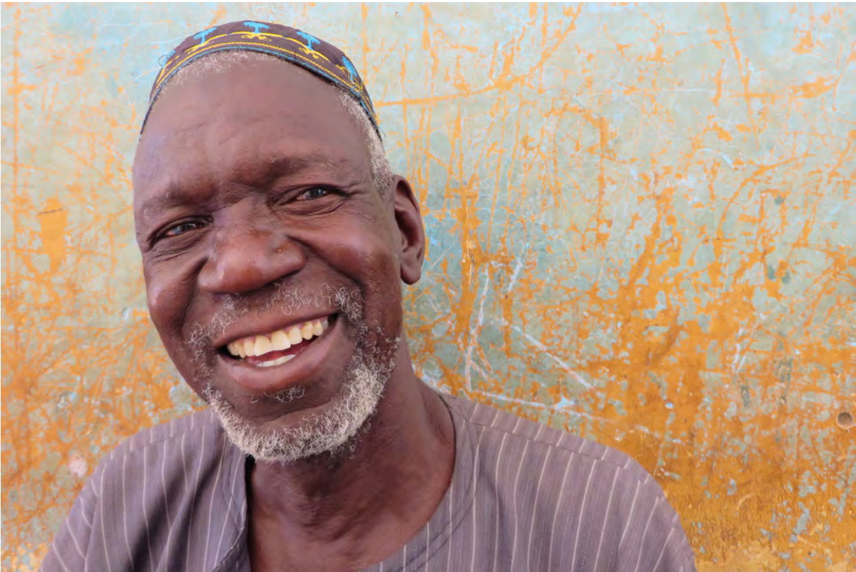
Gender is not a 'women only' issue.

doing them differently. While in some cases, gender-related issues can be rather complex and require technical capacity (e.g. addressing sexual and gender-based violence), minor adaptations are frequently all that is needed to ensure adequate responses to differentiated needs (e.g. distributing food packages that are not too heavy to be carried by all beneficiaries, including older women).