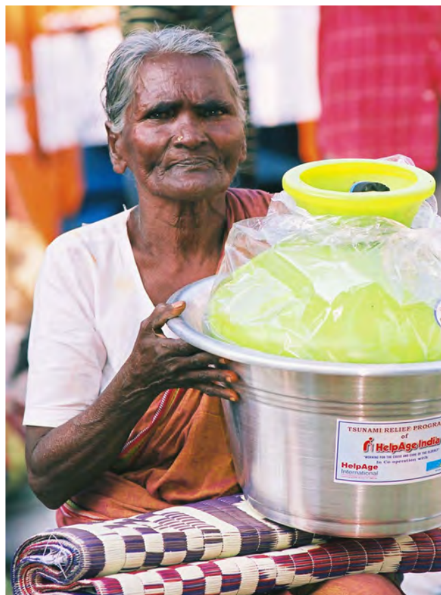
A 70-year-old woman receives aid after the tsunami struck India.

The abovementioned commitments and tools for effective implementation of this gender policy will ensure that the Commission moves towards a systematic approach to gender integration aimed at improving the quality of humanitarian assistance .