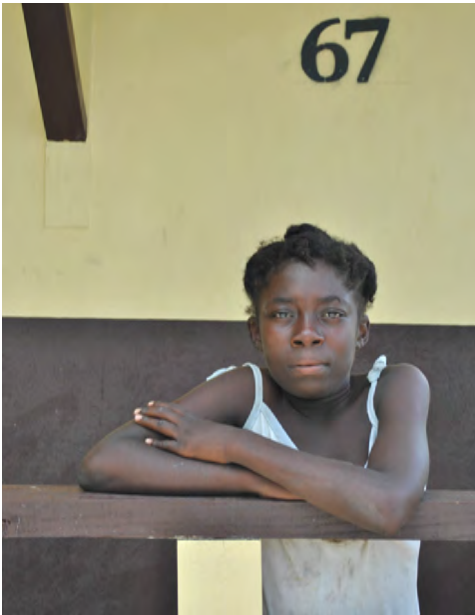
A girl looks from the verandah of her new house, built with international humanitarian aid in Haiti

Furthermore, recognising that beneficiaries are not a homogenous group, the Commission considers that a comprehensive understanding of vulnerabilities must take into consideration multiple aspects of diversity (age, disability, minorities, etc.), which can intersect with gender to produce multiple discrimination and greater vulnerability.