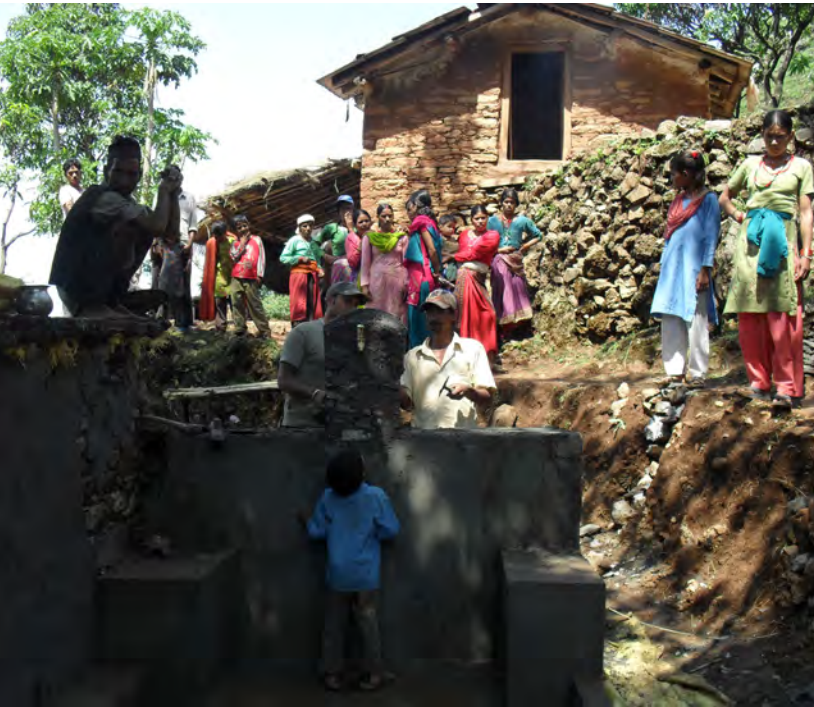
Gender-insensitive actions may deprive some beneficiaries of vital assistance.

a weapon of war and as a tactic to terrorise communities.