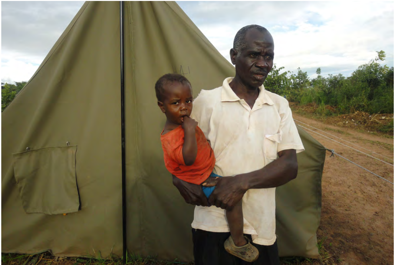
Crises can also be an opportunity to challenge traditional gender roles.

vulnerabilities or risks (e.g. recruitment of boys as child soldiers or sexual violence targeted at boys or men).