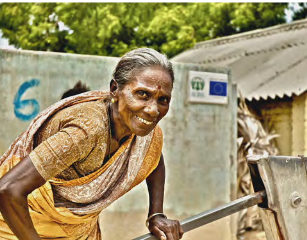
The European Commission is supporting Sri Lankan refugees through food assistance, shelter and water and sanitation services - gender considerations matter in all these different sectors.

This section outlines the framework for gender-sensitive humanitarian operations funded from the EU humanitarian budget.