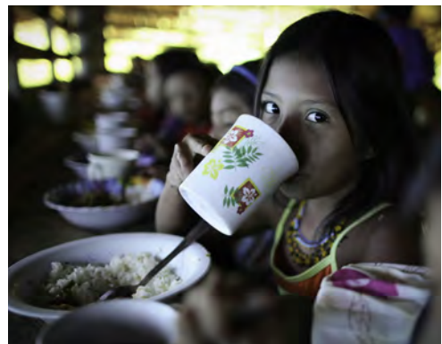
Some actions may need to target specific groups, such as young girls.

Example 8: In a project implemented in Colombia , women who attended hygiene promotion sessions demonstrated a significant increase in hygiene awareness although they lacked sufficient access to soap. Since household budgetary decisions were taken by men, they were invited to participate. The sessions were then scheduled to take into account their working hours and focused on economic arguments (a small investment in soap meant fewer healthcare costs). In the end, some men recognised that, despite some initial reluctance, consulting their wives on household expenditures was useful and actually improved family relations.