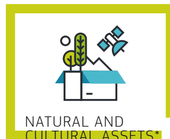
NATURAL AND CULTURAL ASSETS*

* Including Earth observation, nature-based solutions, disaster risk reduction and natural capital accounting, and heritage alive.