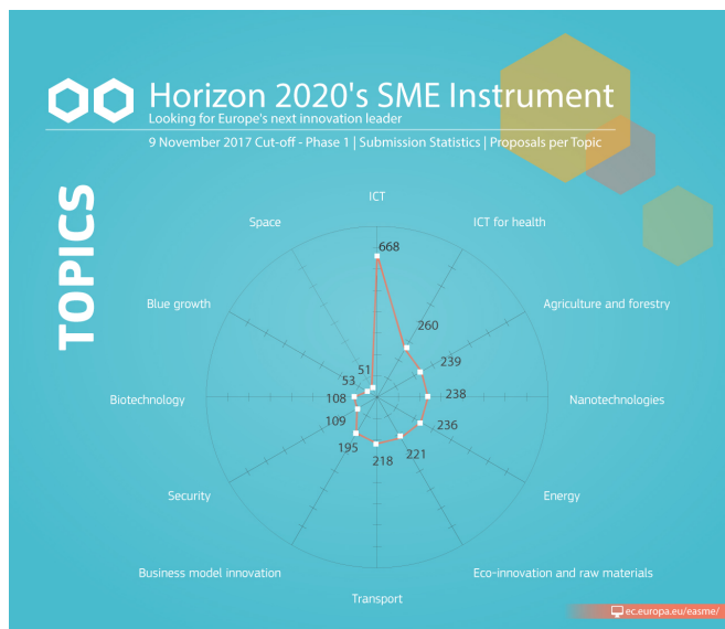
This image shows the number of applications per topic for SME Instrument Phase 1 November 2017 cut-off [4]