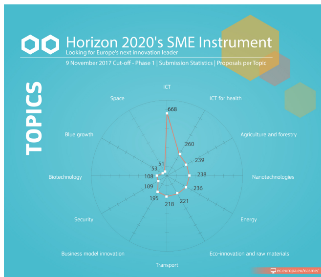
This image shows the number of applications per topic for SME Instrument Phase 1 November 2017 cut-off [4]