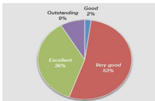
Figure 2: Breakdown of performance levels for the NF HQE® certification