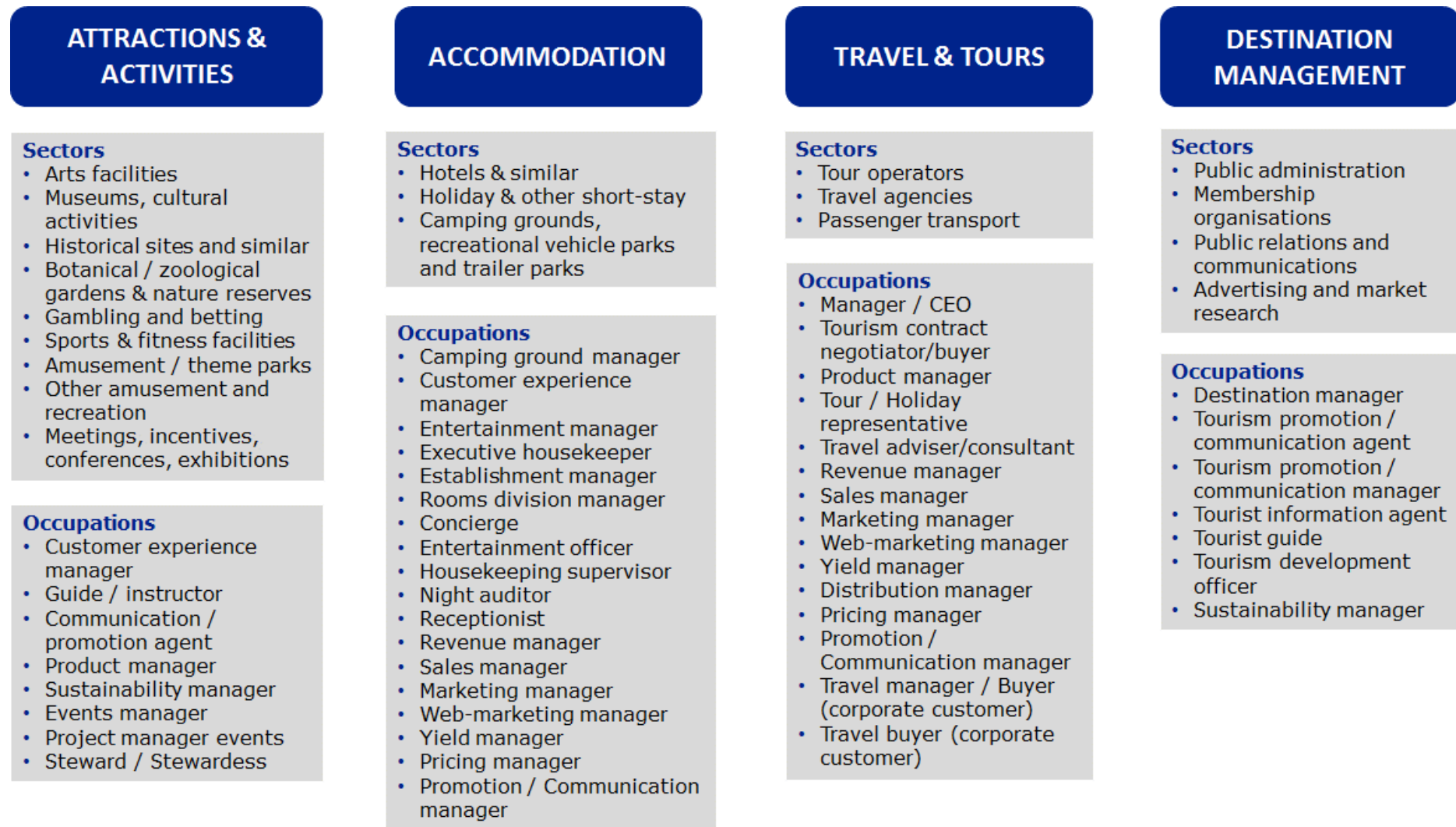
Figure 3.1 Mapping of tourism occupations by sector