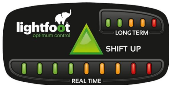
A graphical representation of the driver behaviour technology interface of Ashwoods.

Problem 2 – The objective of this project was to develop optimal nano-structured membranes and a large variety of installations for various CO 2 capture applications at power plants. The use of this technology for gas separation processes has the potential to reduce CO 2 emissions, one of the Kyoto protocol recommendations. Development and usage of cost-effective membranes to remove CO 2 from expelled gases in industrial applications enables the reduction of the energy costs associated with CO 2 separation to less than € 20 per ton. Other specific objectives for this project were to test and develop smart-design modules, with a long life and low degradation and contamination. These were to be tested in both the laboratory and the field and combined with integrated performance monitoring. Another innovation goal for this project was to enable the liquefaction of the gases after separation, which results in reduced transportation costs.