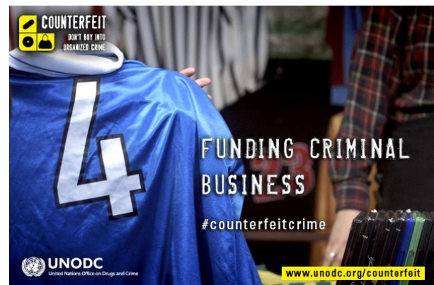
Figure 3: Global campaign to raise consumer awareness by the UNODC

Another major issue explaining the need for new anti-counterfeiting methods was highlighted in a 2013 PwC survey on counterfeiting 17 . Despite 90% of respondents believing it to be morally wrong, they were far more concerned about losing their bank account details than getting caught.