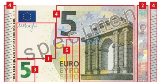
Figure 1: Overt features on a EUR 5 note