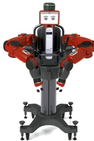
Figure 1: Baxter, pioneer collaborative robot

The robot Baxter developed by Rethink Robotics (see Figure 1), is often considered as the first of its kind and has paved the way for a wave of followers. While each firm is adding its own technology and innovativeness to the final product, a few characteristics are shared among collaborative robots such as safety features, user-friendliness or flexible use as mentioned above.