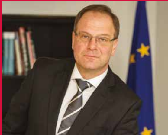
Tibor Navracsics Commissioner for Education, Culture, Youth and Sport

This generation of young Europeans has been hit hard by the economic crisis. The transition from education into the labour market has become more difficult. About one out of five young jobseekers under 25 cannot find work. And many young people believe that their concerns are not taken up by politicians. More than half of them feel that in their country young people have been marginalised and excluded from economic and social life.