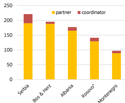
Western Balkans: Participation in CBHE projects, 2015-2020

Capacity building projects can be addressed to a group of countries or a single country. They can also be cross-regional, including institutions from different partner regions.