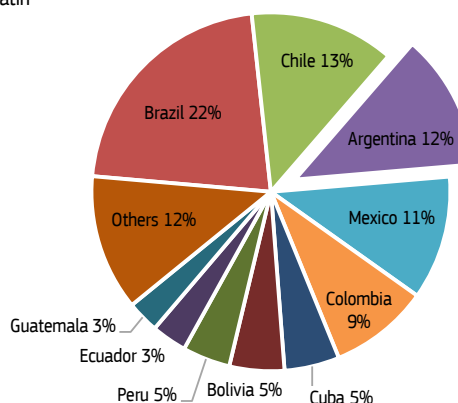
ICM Regional Budget Latin America 2015-2019

There are distinct budgets for different regions of the world that are divided between all the European countries. Programme-Country institutions make up bilateral partnerships with universities from Latin American countries and apply on behalf of their partners.