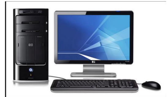
Central computerised database