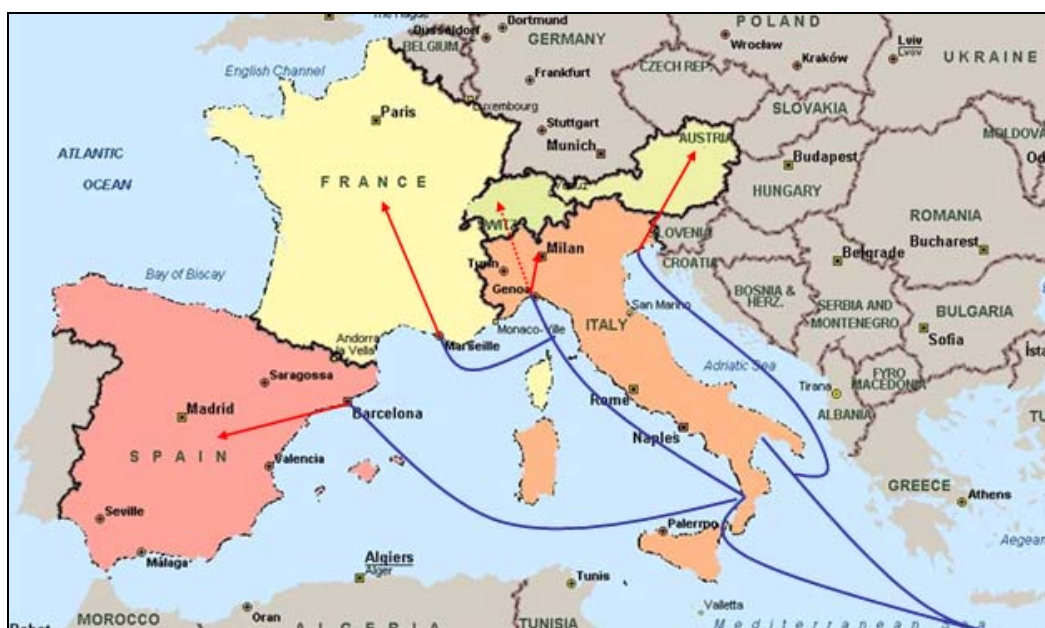
Map 2 Footprint of the “Alternative scenario”

Map 2 shows the containerised traffic departing from the Far East, and arrives to Switzerland, Italy, Austria, Spain and France through Italian ports. In the following table are reported the “origin / destination” distances (expressed both in km for road and rail and in nautical miles for maritime transport) for both of the scenarios: