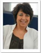
CORINNE LEPAGE, Member of the European Parliament

Députée au Parlement Européen depuis juin 2009, Corinne Lepage est vice-présidente de la commission environnement, santé publique, sécurité alimentaire, elle est suppléante dans la commission industrie, recherche et énergie. Elle siège au sein du groupe ADLE.