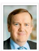
INGMAR HANSSON, State Secretary for Tax issues, Ministry of Finance, Sweden

His early research in public economics focused on computable general equilibrium models of taxation, marginal effective tax rates, the marginal cost of public funds, and distributional effects of taxes on a lifetime basis. Recent research includes the distributional effects of social security. In environmental and energy economics, he works on household disposal of garbage and recycling, policies for green design, vehicle emission control policies, carbon taxes, and other second-best policies in the energy sector where direct environmental taxes are not feasible.