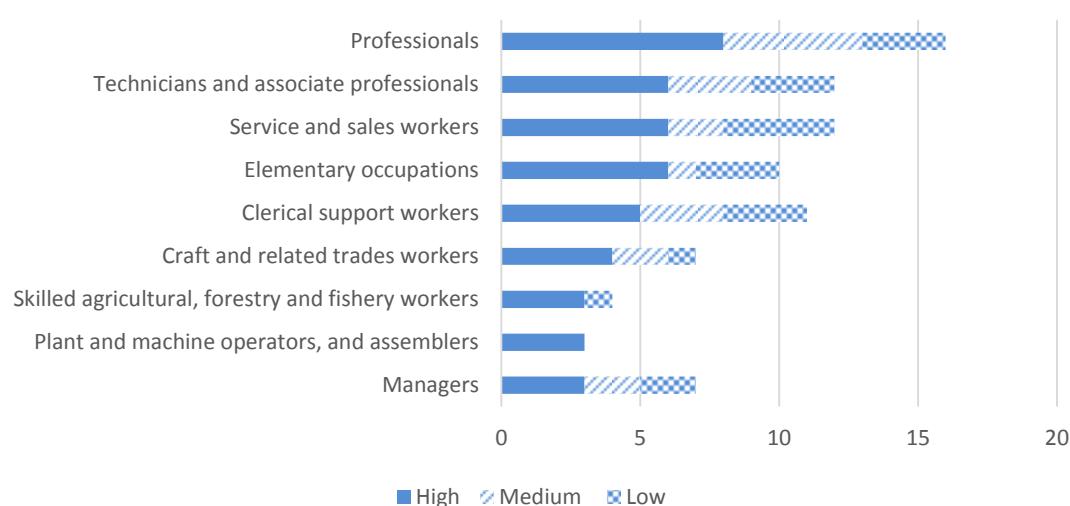
Figure 2.2 Surpluses by estimated surplus magnitude

Interestingly, the three PES who identified surplus occupations among plant and machine operators and assemblers rated all the occupations they identified in this group as being surplus occupations of high magnitude.