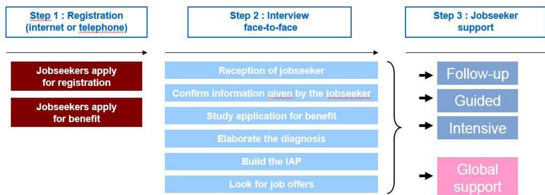
Figure 1. A three-step process of registration, profiling and engagement

The profiling is undertaken by the caseworker at the initial registration and diagnosis interview. It determines the journey of the jobseeker and the engagement pathway that they will follow. The four types of engagement pathways (see figure 2, below) differ in terms of the nature (phone, online, face-to-face) and frequency of the contact between jobseekers and caseworkers, as well as the services provided to the jobseeker: