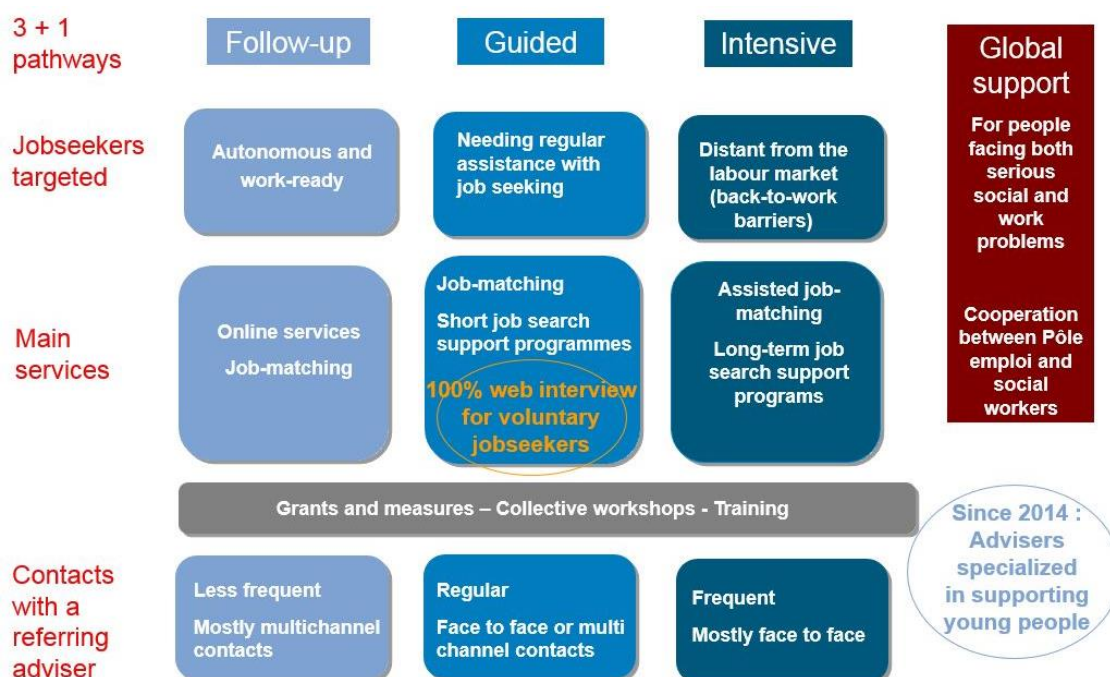
Figure 2. Four types of engagement paths

The French PES profiling system is based on caseworker assessment. In order to support the caseworker’s appraisal, two tools are available. First, a labour market information tool ( information sur le marche du travail ), which is a statistical tool providing information on the local labour market situation (for instance, by identifying professional categories where there is a high level of demand). Second, a job matching tool ( systeme de rapprochement des offres ), based on a French national classification, allows the caseworker to match job offers with jobseekers’ profiles, established on the basis of information given during the initial registration and diagnostic interview.