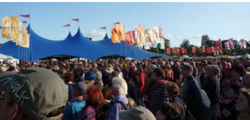
Crowd at WOMAD Charlton Park 2009.