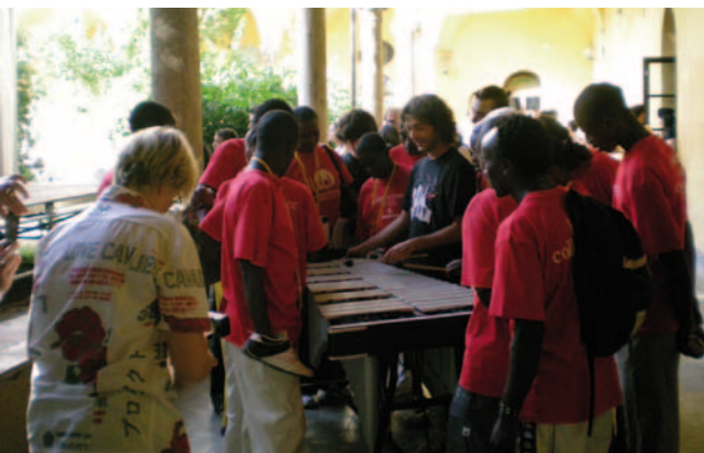
A moment of interaction among students at Umbria Jazz Clinics, 2009.

During the three days and nights of the festival, young people from different countries meet in Barcelona to listen to music and dance, to get to know people with different cultures and origins, and to enjoy together the joyful and sunny context of the city. In the case of the Sonar festival, electronic and dance music represent a strong cultural and aesthetic ‘catalyser’ which stimulates intense audience participation and a subsequent cosmopolitan attitude. Indeed, electronic and dance music represent, in a similar way to jazz music, a common language, especially for young people and new generations of festival-goers. Artificial sounds, electronic rhythms, as