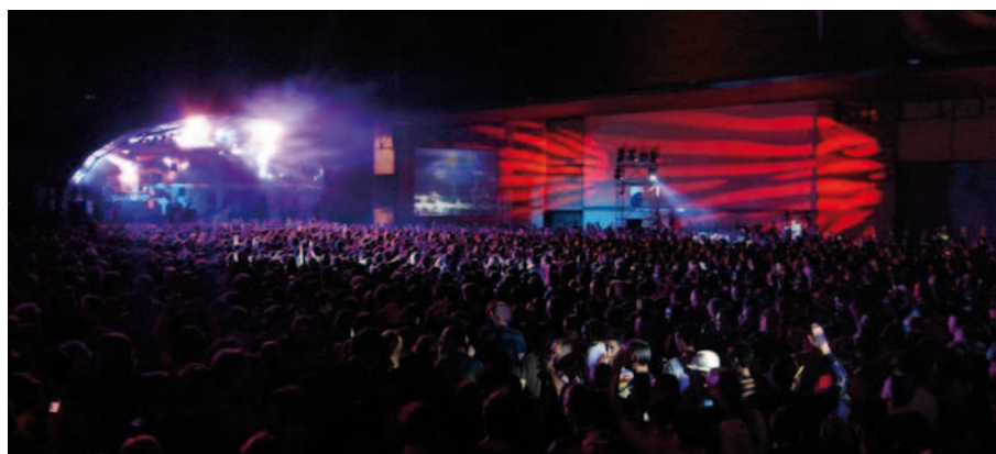
Sonar by night.

The second main location of the festival is the space of the city's trade fair. It is a huge space which can safely hold as many as 40 000 people each night. In this context, the festival hosts the more appealing and famous performances, and the core attraction for the audience consists in active participation: dancing to the music mixed by the most celebrated international DJs. In contrast to the situation during the day, the night events hosted in the trade fair do not offer