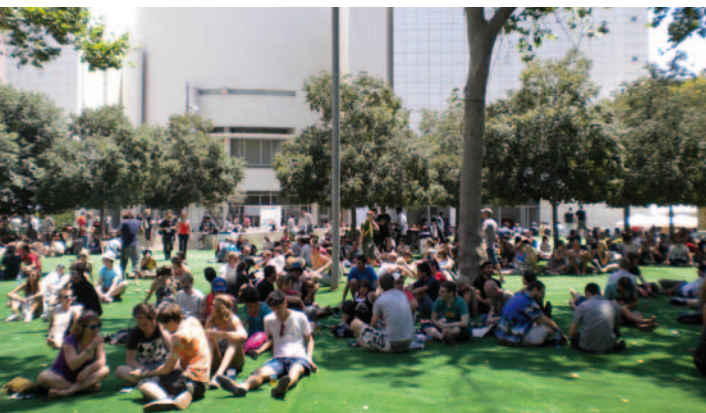
The square in front of the Museum of Contemporary Art in the centre of Barcelona during Sonar 2009.

This last perspective given by one of the festival's organisers reminds us that the relationship between the Sonar festival and local identity, being a crucial element in the development and successfulness of the festival, nevertheless represents a negotiated space, one in which multiple belongings and identities are constantly at play and which cannot be fully ruled from above.