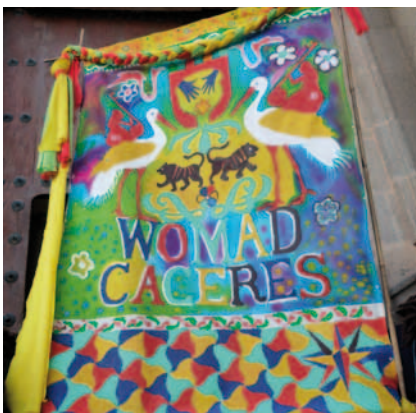
The WOMAD lion, its emblem since its beginning, is encapsulated by two cigüeñas (storks), potent local symbols of the city: banner made by local schoolchildren as part of the 2009 workshops of WOMAD Cáceres.

This chapter has described how these three different music festivals incorporate and exhibit the spectrum along which festivals are caught up in the processes of local identity formation. The question we ask of each of them is how ‘local’ they are, in terms of both support from local institutions and identity politics. A fundamental point is that none of these three festivals really promote and support a ‘local’ music (even though, of course, some of the music performed may be locally produced). Given this rather obvious point, it is unsurprising that the identities of the festivals have been tied to broader internationalist, if not cosmopolitan, ideals. This is the nature of their musical genres, but it is not the whole story.