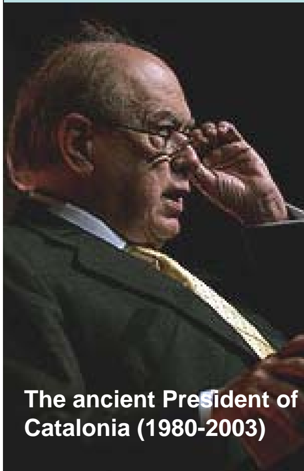
The ancient President of Catalonia (1980-2003)

The Centre d'Estudis Jordi Pujol believes that a society without clear Ideas , solid Values and positive Attitudes cannot move forward.