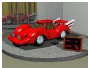
(Kouvola Region, Lappeenranta, car exhibition)