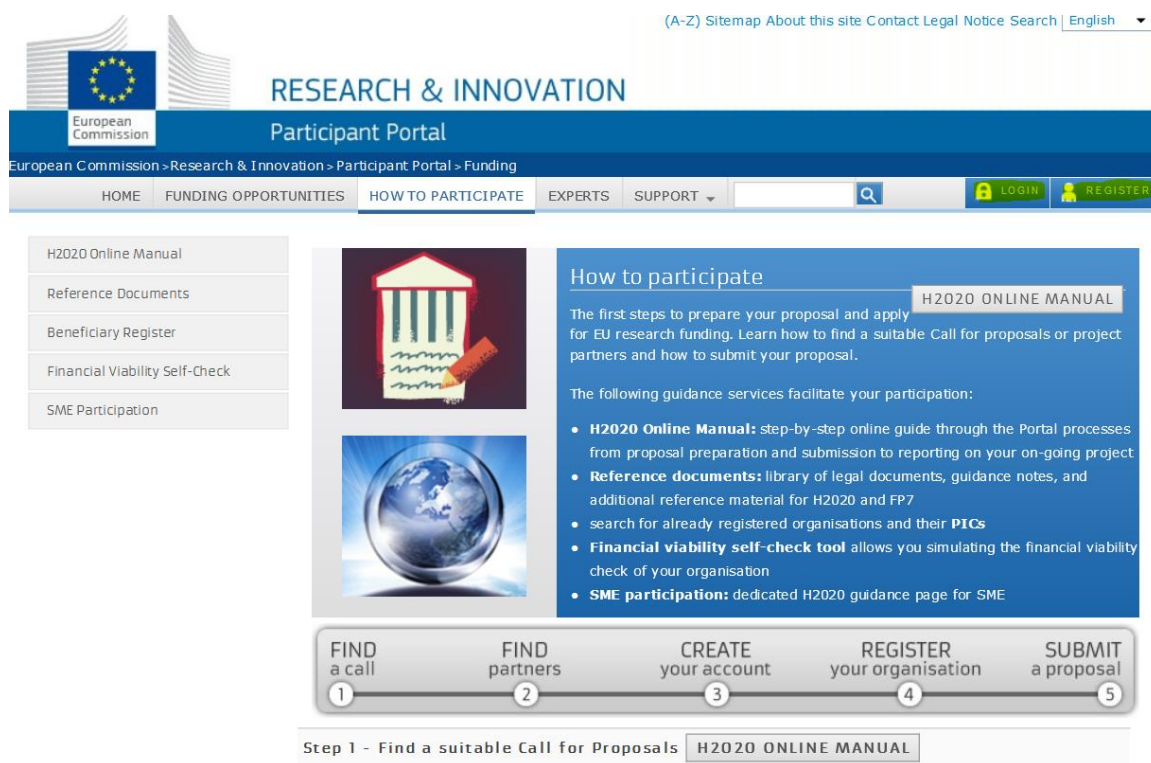
Figure 1: Screen shot of the Participant Portal homepage

You can see in the screen shot above that the homepage refers to registered and non-registered users.