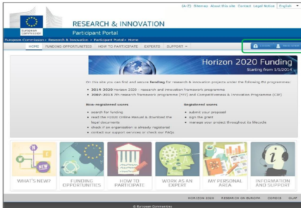
Figure 1: Screen shot of the Participant Portal homepage

You can see in the screen shot above that the homepage (in the upper right corner) refers to registered and non-registered users.