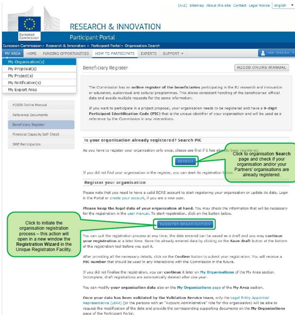
Figure 2: Screen shot of the Beneficiary Register