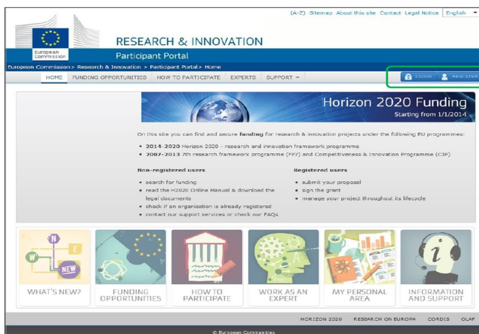
Figure 1: Screen shot of the Participant Portal homepage

You can see in the screen shot above that the homepage (in the upper right corner) refers to registered and non-registered users.