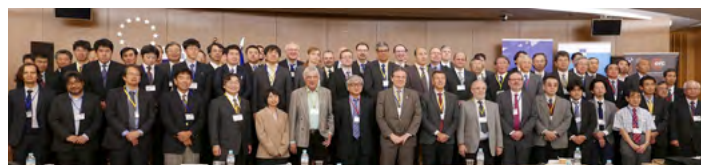
Photo: participants at the symposium on Power Electronics