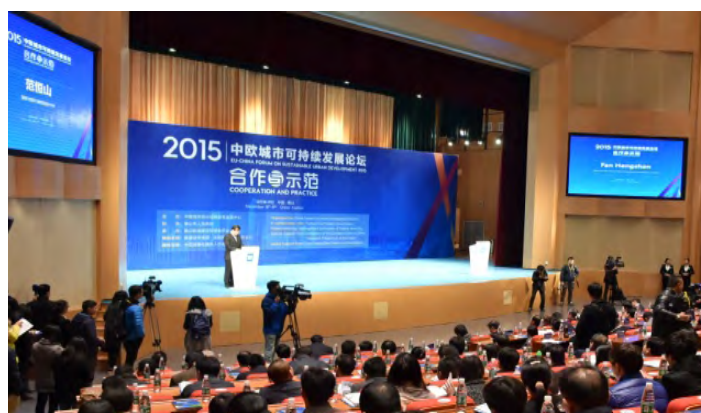
Photo: EU-China Forum on Sustainable Urban Development in Foshan

The Forum facilitated discussion on an urban cooperative mechanism between China and the EU, and promoted pragmatic urban cooperation between China and EU Cities with 13 project agreements signed between Chinese and European cities. Panel discussions focused on Sub-regional Integration, Investment and Financing with PPP, Technology Innovation and Smart Cities, Green Growth and Low-carbon Cities. The Forum also facilitated improvement of the EU-China Paring Mechanism through a round table between Chinese mayors and European stakeholders.