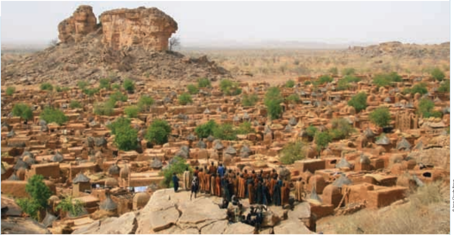
Plaine de Songo - Mali