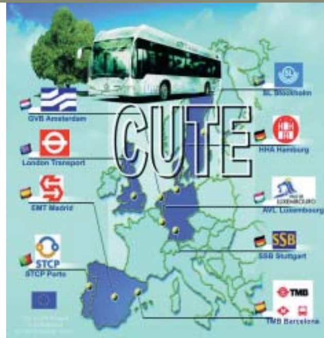
Picture map of Europe and bus company logos.