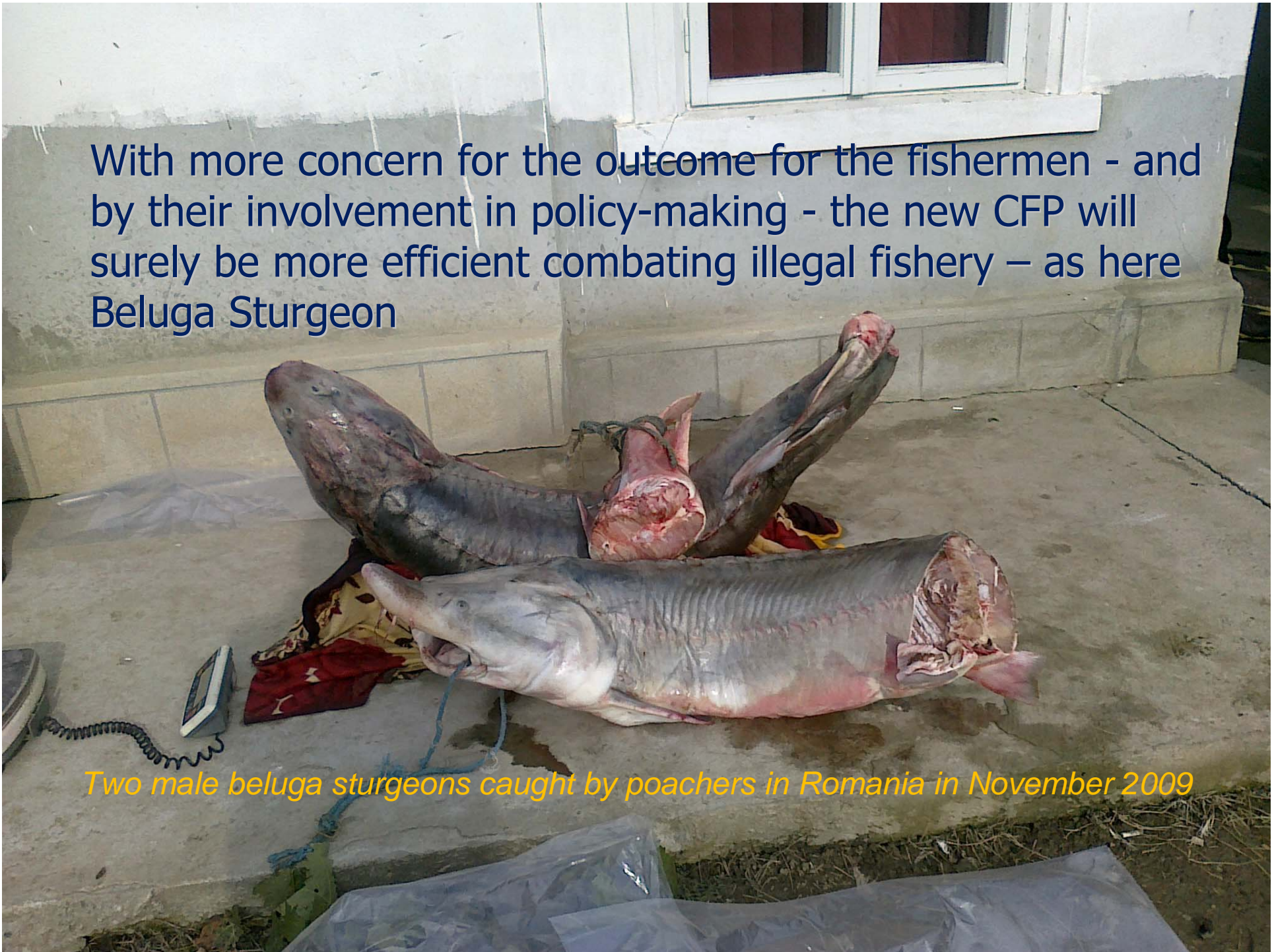
Two male beluga sturgeons caught by poachers in Romania in November 2009

With more concern for the outcome for the fishermen - and by their involvement in policy-making - the new CFP will surely be more efficient combating illegal fishery – as here Beluga Sturgeon