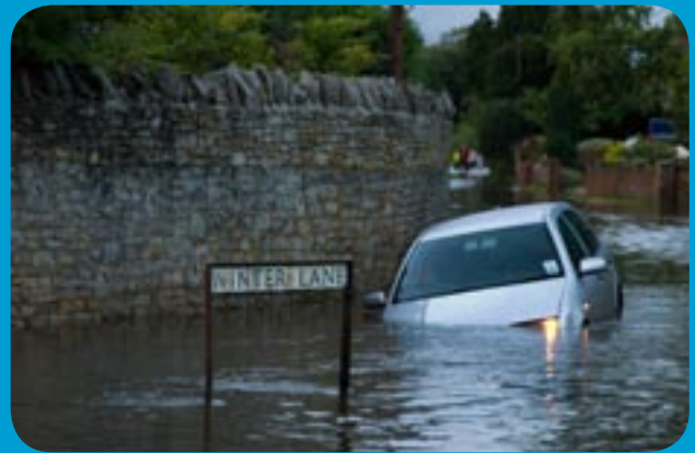
The UK received €162.4 million of emergency aid after 2007's devastating floods

The UK benefited from such aid following major flooding in June and July 2007, which caused severe damage to infrastructure, businesses and private households in several parts of the country. Damage was estimated to amount to over €4.6 billion. The UK received aid totalling €162.4 million to help deal with the consequences of these devastating floods.