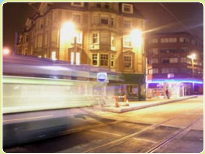
Beating the traffic with the help of public and private finance in Nottingham

In March 2004, Nottingham's first tramway, within the framework of the Nottingham Express Transit (NET) project, was launched to combat the major issues of traffic congestion in the city centre. The originality of the project lay in the collaboration of public and private partners, the first project developed in the UK in the framework of the Private Finance Initiative (PFI). Success was immediate. In its first year, 8.4 million trips were made, increasing to 9.7 million the following year. At peak times, public transport usage has increased by around 20%. The total cost amounted to €300 million, with an EU contribution of €4.2 million.