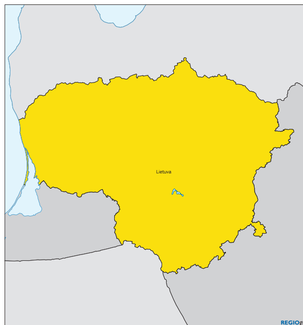
Lithuania: Regional innovation performance, 2017